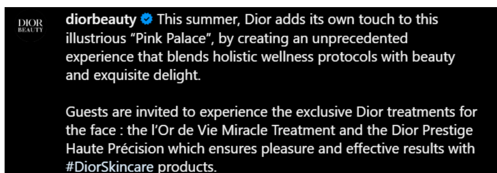
Picture 3 Dior Beauty's Instagram post

Dior Beauty's slogan "Happiness is the secret to all beauty; there is no beauty that is attractive without happiness" sends a message to their audience that the most important thing to beauty is happiness and without it, beauty is meaningless. Even though the brand is selling all kinds of facial and body care products, Dior still tries to relate to their consumer by not glorifying beauty standards and found a more general thing to lean on such as "happiness".