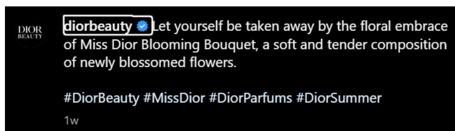
Picture 1 Dior Beauty's Instagram post

We found that most of the marketing strategy Dior use in their social media is using some kind of solicitation sentence as a way to get people's attention and instill a sense of participation. This way it can easily connect to a larger audience and still attach a premium experience to their brand. This type of syntactical feature is simple, concise, and compact yet keeps the connection to its follower and member.