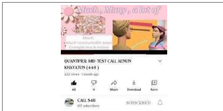
Picture 5 A video that researchers use as a reference