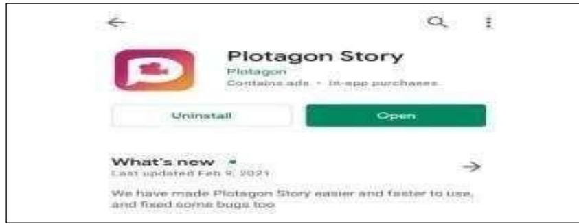
Picture 1 Plotagon story application display on android