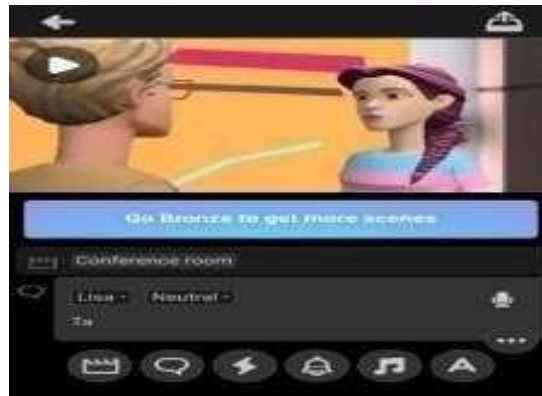
Picture 4 The edit view of kinemaster application