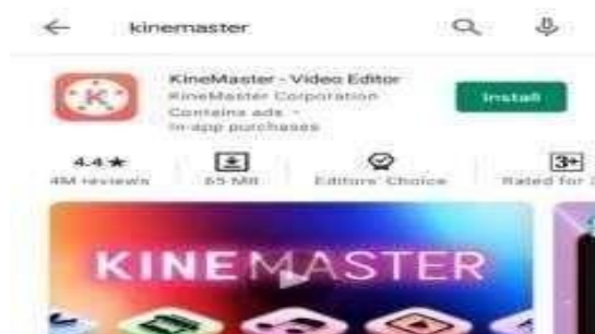
Picture 3 Kinemaster application display on android

Kinemaster is a full-featured and professional video editing app for IOS and Android devices. Kinemaster is a Smartphone that software specifically used for video editing purposes. This software was developed by next streaming. This software was first released in 2013 to be exact on December 26, 2013. It supports multiple layers of video, audio, image, text, and effects equipped with various tools that allow teachers to create high-quality videos. The subject matter is designed as attractive as possible, can display videos, as well as animated images related to the subject matter so that students focus more on what is conveyed by the teacher. In addition, kinemaster videos can be directly shared to social media platforms such as YouTube, WhatsApp, Facebook, Google+, and many more. This makes it easy, especially for teachers, to publish their videos and reach students. The learning process will be more fun so that it affects the increase in student interest in learning.