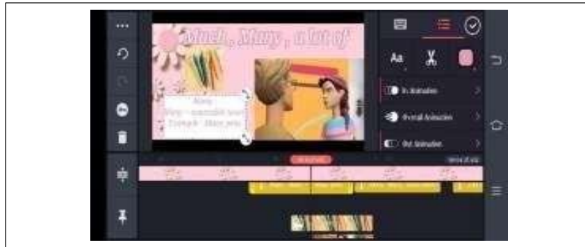
Picture 2 The edit view of plotagon story application

Kinemaster is a full-featured and professional video editing app for IOS and Android devices. Kinemaster is a Smartphone that software specifically used for video editing purposes. This software was developed by next streaming. This software was first released in 2013 to be exact on December 26, 2013. It supports multiple layers of video, audio, image, text, and effects equipped with various tools that allow teachers to create high-quality videos. The subject matter is designed as attractive as possible, can display videos, as well as animated images related to the subject matter so that students focus more on what is conveyed by the teacher. In addition, kinemaster videos can be directly shared to social media platforms such as YouTube, WhatsApp, Facebook, Google+, and many more. This makes it easy, especially for teachers, to publish their videos and reach students. The learning process will be more fun so that it affects the increase in student interest in learning.