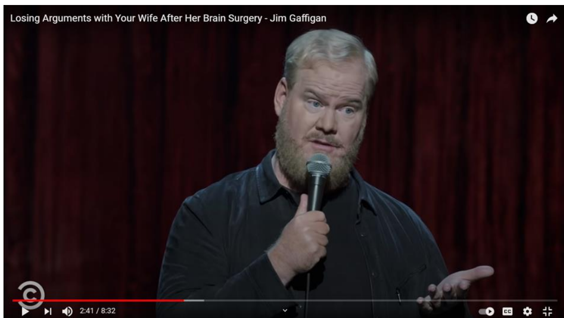
Figure 2 YouTube Printscreen